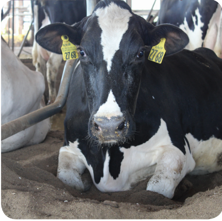
Dairy cows on recycled bedding at Reinford Farms in Mifflintown, Pa.