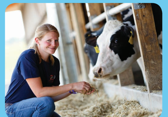
Ivy Lakes Dairy, New York