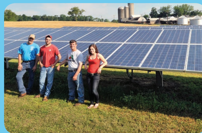
Fulper Farm, New Jersey