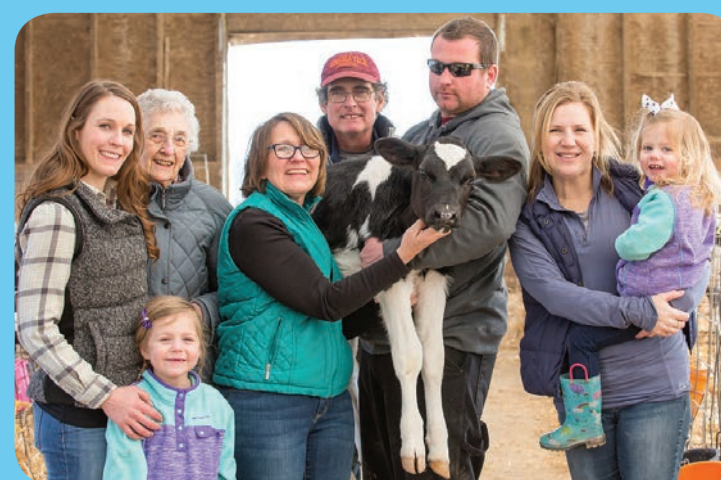
Tucker Farm, Maryland