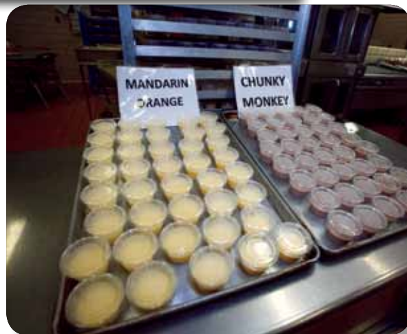
Yogurt smoothies, like the ones shown above, and parfaits are favorites among students. In fact, when ADADC conducted a six-week pilot in 98 schools, yogurt sales soared from 43 cups a day to 436 cups daily—an increase of over 98 pounds of yogurt a day or 914%!