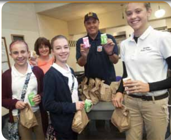
The Scranton (PA) School District expanded Breakfast After the Bell to all of their 19 schools – increasing daily participation from 2,200 to 5,680 or more than 150%! Here, West Intermediate School students pose for a picture with former New York Giants punter Sean Landeta and dairy farmer Elaine Noble.