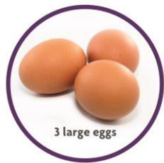
3 large eggs