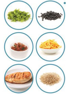
Chicken Fiesta Bowl 40g Protein • 68g Carbs

3 oz. chicken breast with 1/8 cup teriyaki sauce 1 cup brown rice 1 ½ cups stir fry vegetables