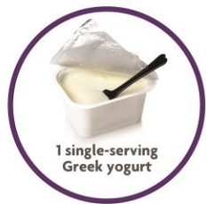
1 single-serving Greek yogurt