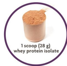
1 scoop (28 g) whey protein isolate