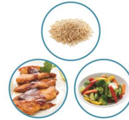
Fuel Up Stir Fry 33g Protein • 59g Carbs

2 scrambled eggs with 1/4 cup Cheddar cheese 1 whole wheat tortilla 1/2 cup plain yogurt with 1 cup raspberries