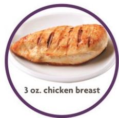
3 oz. chicken breast