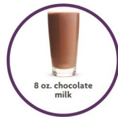
8 oz. chocolate milk