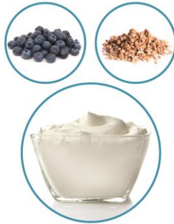
Blueberry Yogurt Parfait 22g Protein • 41g Carbs

1 ½ cups low-fat chocolate milk 1/4 cup almonds