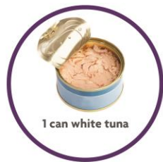
1 can white tuna