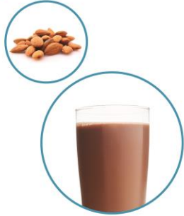
Chocolate Milk and Almond Refuel 20g Protein • 53g Carbs

1 ½ cups low-fat chocolate milk 1/4 cup almonds